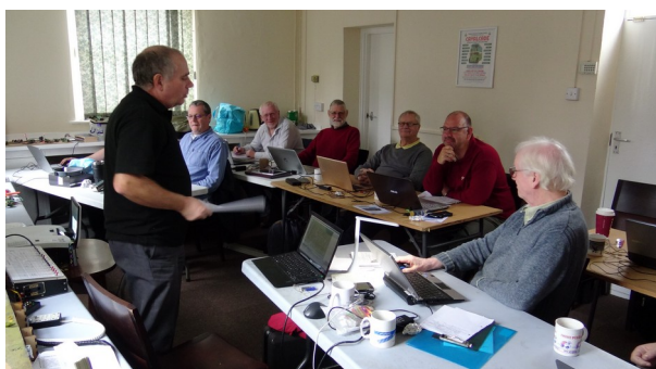
Pictures from recent JMRI and CBUS courses at Rushden Transport Museum

Rushden Historic Transport Society (RHTS) are based at the restored Rushden Station. They recently acquired the historic goods shed across the road, it having previously been in use as a council depot, which now forms part of the Rushden Transport Museum and Railway. See www.rhts.co.uk for more information.