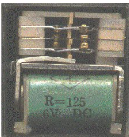
Relay showing coil and switch contacts